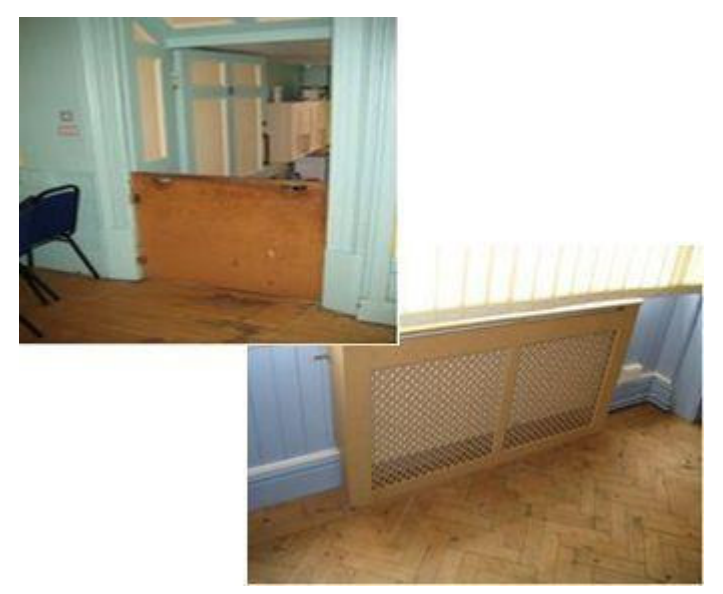
Improvements to the Town Hall

The partnership working with Stroud District Council, the Highways Agency and GRCC has allowed the group to identify who it is specifically that can help them to address any situations that arise in the community. The fact that the steering committee is so dedicated to completing the actions has meant that a really strong networking hub has been created whereby local authority agencies are able to feed into the plan when applicable.