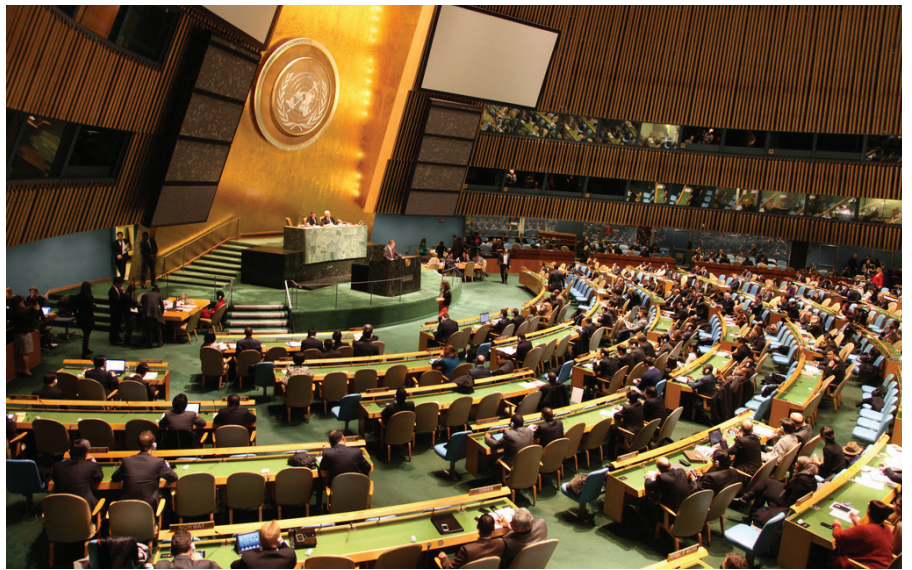
Day of the ATT vote at the United Nations General Assembly Hall, April 2013.

As a consequence, and in line with the UNGA rules of procedure, a further resolution proposing the adoption of the ATT was brought before the General Assembly. There it was adopted by a large majority on 2 April 2013, with 155 States voting in favour, 3 States voting against, and 22 abstaining.