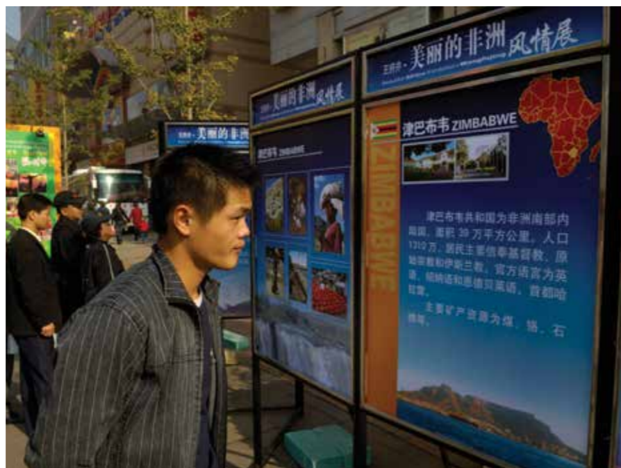
A young man in Beijing reads about Zimbabwe on a display for the 2006 China-Africa Summit.

Nonetheless, as dialogue increased on this issue and concerns and misconceptions were addressed, China showed greater flexibility. At the Tenth Session of the OWG, China stated that “we acknowledge the importance of peaceful and non-violent societies, rule of law and capable institutions and their linkage with development, which create an enabling environment for sustainable development.” 38 In addition, at the 12th and 13th Sessions of the OWG, China was open to putting a number of peace-related targets into a merged Goal called “Means of implementation, enabling environment for sustainable development and strengthening institutions”, combining Goal 16 and Goal 17. This included targets on violence reduction, corruption, organised crime, illicit flows of arms, finance, drugs and wildlife as well as