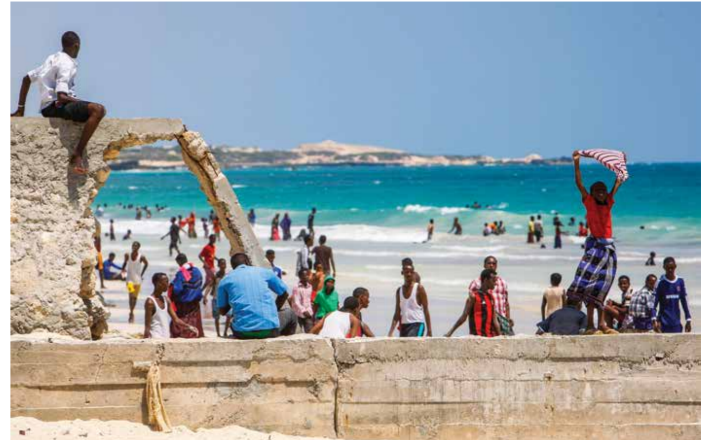
People visit Lido Beach in the Somali capital Mogadishu. The African Union Mission in Somalia (AMISOM), a peace enforcement mission, has been deployed in southern and central areas of the country since 2007. AMISOM has received significant financial and logistical support from China.

“The support for the promotion of peace and stability in Africa has been voiced at the highest political level in China.”