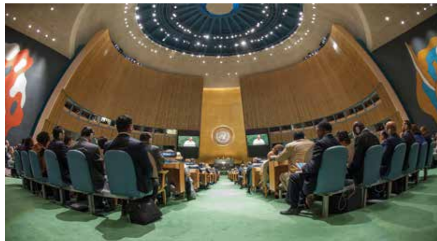
Pope Francis addresses the UN General Assembly at the UN Sustainable Development Summit in September 2015, during which the SDGs were adopted.

The global debate on what development framework will replace the Millennium Development Goals (MDGs) has come to an end. After two years of discussions, a finalised text of the 2030 Agenda for Sustainable Development – previously called the Post-2015 Development Agenda – has been agreed at the United Nations (UN) Headquarters and was formally adopted at the UN Sustainable Development Summit on 25 September 2015. During the UN Conference on Sustainable Development, Rio+20, in 2012, UN Member States adopted an outcome document, which set out a mandate to develop a set of SDGs and to integrate these into the 2030 Agenda. It also stated that the new development framework should integrate the economic, social and environmental dimensions of sustainable development in a comprehensive manner. 1 The international community has adopted a development framework which aims to be much more ambitious and transformative than the MDGs. Unlike the MDGs, the SDGs are set to be universal in nature and apply to all countries.