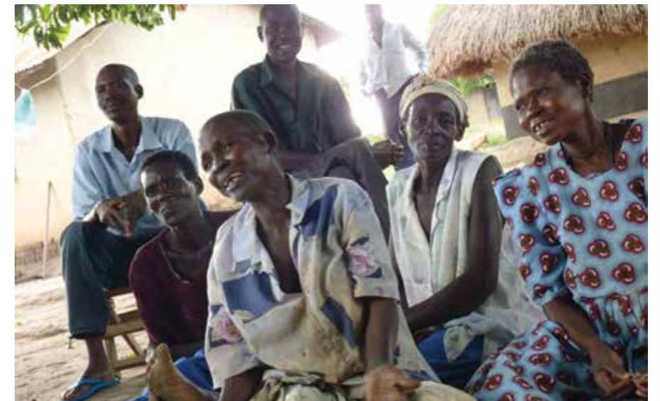
Women take part in a focus group discussion conducted as part of a study on resource and land conflict in northern Uganda. An SDG target on fair access to resources and control over land is included in the 2030 Agenda.

Peace is also about much more than just the absence of physical violence. While often the search for peace is seen as an end to armed conflict or the enforcement of stability, for many peacebuilders the absence of physical violence is only the shallow beginning of a much longer-term peacebuilding process. A deep or 'positive' peace includes changes in the attitudes of conflicting parties and the transformation of the systemic and structural elements that form part of the reasons for why the tensions that are present in every society spill over and become violent. Acknowledging and transforming structural violence, including the systems responsible for marginalising and exclud-