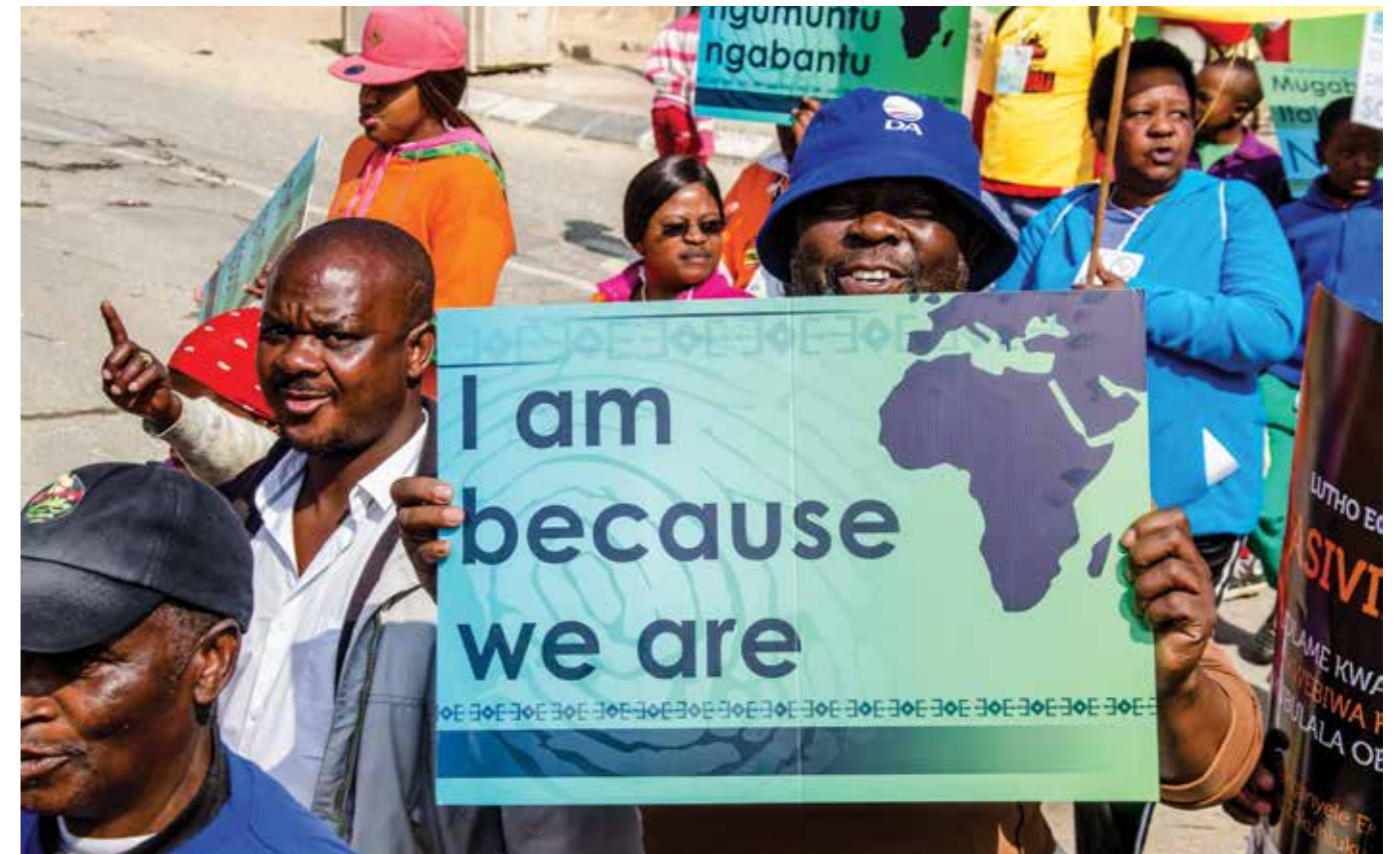
People take part in a march to promote African solidarity in an area of Alexandra, South Africa that is affected by xenophobic violence.

China still views itself as a developing country with its own domestic challenges and is reluctant to be seen as a donor. As such, China does not believe it should make concrete commitments on aid to the same degree as developed countries. In addition, China has tended to envision a narrower development framework, which focuses on the three core pillars of development – the economic, social and environmental pillars 32 – while Africa has committed itself to a more ambitious agenda, which includes issues of human rights, good governance, rule of law and peace and security. 33