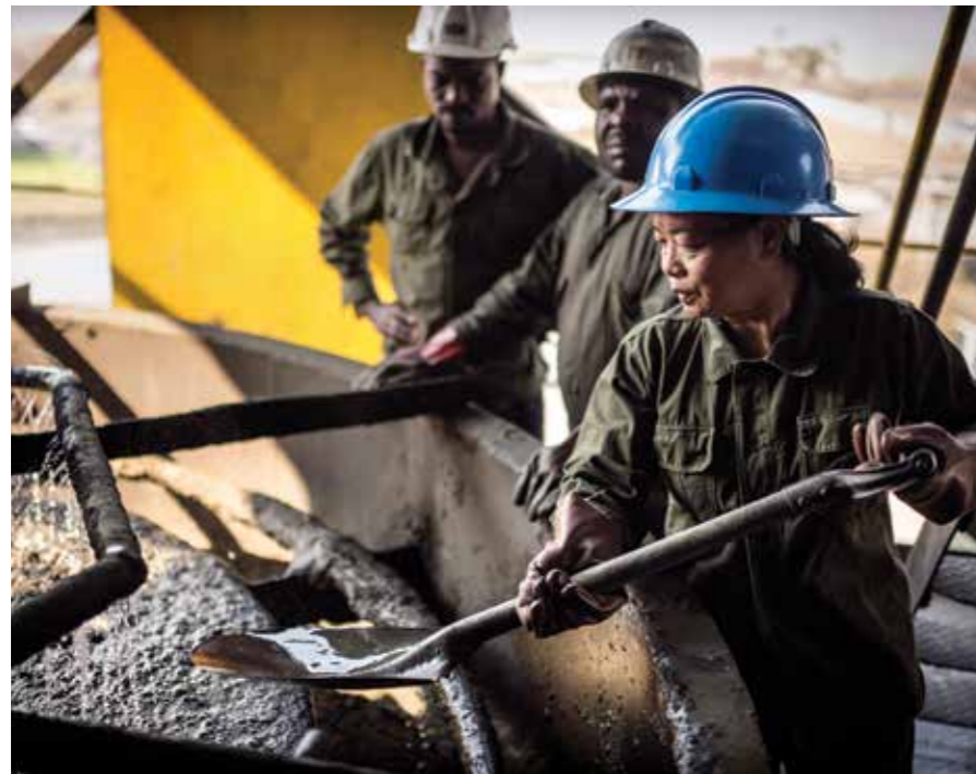
A Chinese operations manager works at a copper mine in Zambia. The mine is owned by the Non-Ferrous Company Africa, a Chinese company that owns and operates several mines in Zambia's Copperbelt Province.

It is argued by Chinese officials and scholars that China's engagement on African peace and security issues extends beyond reactive and hard security approaches – such as the deployment of peacekeepers – to actions that will help address the root causes of conflict. Promoting economic growth has been seen as one such contribution. During a UNSC meeting on post-conflict peacebuilding in March 2014, Chinese Ambassador Liu Jieyi stated that “...post-conflict peacebuilding efforts should focus on removing the deep-rooted causes of conflict, with a particular