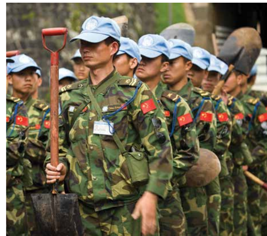
Chinese peacekeepers in the Democratic Republic of the Congo march to a road rehabilitation project, which was undertaken to enable greater access to the Ruzizi One Dam Power Plant – the only source of electricity for the east of the country.

The FOCAC process has been a key forum for specific agreements on African peace and security. Peace was identified as one of five key areas for deepened cooperation in former President Hu Jintao’s speech at the opening ceremony of the Fifth FOCAC meeting in July 2012. He stated that the Chinese and African people shared a desire to seek peace and development and recognised the need to “promote peace and stability in Africa and create a secure environment for Africa’s development”, which China would contribute to. 45 In the current FOCAC Action Plan (2013–2015) which emanated from this meeting, China and Africa stated that they “shared the view that the challenges confronting