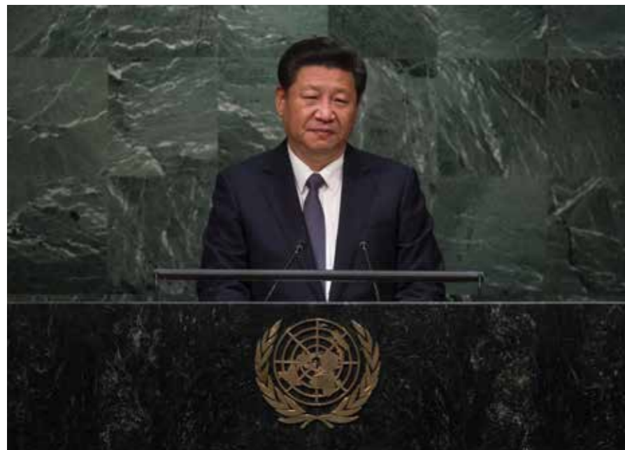
Xi Jinping, President of the People's Republic of China, addresses the United Nations summit for the adoption of the 2030 Agenda.

However, China and Africa's positions also differed slightly. Although both sides uphold the principle of Common but Differentiated Responsibilities (CBDR), Africa put more emphasis on the growing importance of South-South cooperation and would like to explore this area of cooperation further, working with a range of different development partners. 30 China, however, has argued that “North-South cooperation should continue to serve as the main channel of development financing” and that “South-South cooperation is a supplement to North-South cooperation”. 31